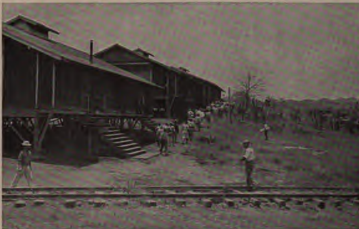
Laborers hurrying to the mess-hall